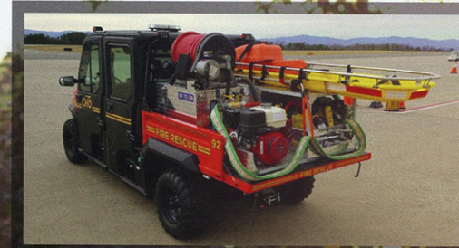
THE GROWTH OF UTVS